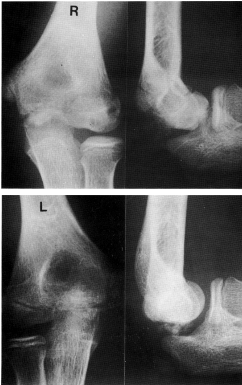
Fig. 3a-b: Case III. Boy 12 year-old. Hypoplastic / dysplastic changes at the elbow epiphyses. The right elbow is more severely affected.

The family history revealed that both her mother and grandmother were short - 140 cm and 137 cm respectively. The physical examination of the mother was normal apart from lateral deviation of the toes.