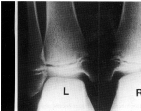
Fig. 2a: Case II. Boy 13 year-old, a: Flattened, dense distal tibial epiphyses with fragmentation of the right one. Note minor metaphyseal changes.

13 year-old boy presented for orthopaedic consultation because of pain of his right ankle for one month. For several months he had been distorting his right shoe and his mother was keen to get an arch support from a surgical firm to treat that. He was otherwise well. His height (143 cm) and weight were normal. He was not active in sport. The family history was negative. The routine blood and urine examinations serum P, Ca, serum alkaline phosphatase, urinary acid patterns, serum lead levels and methylmalonic acid screen were normal. Skeletal survey documented sclerosis, flattening and fragmentation of the distal tibial epiphyses (Fig. 2a). Sclerotic bands were present at the end of the long bone metaphyses (Fig. 2b-c). No other abnormality was seen.