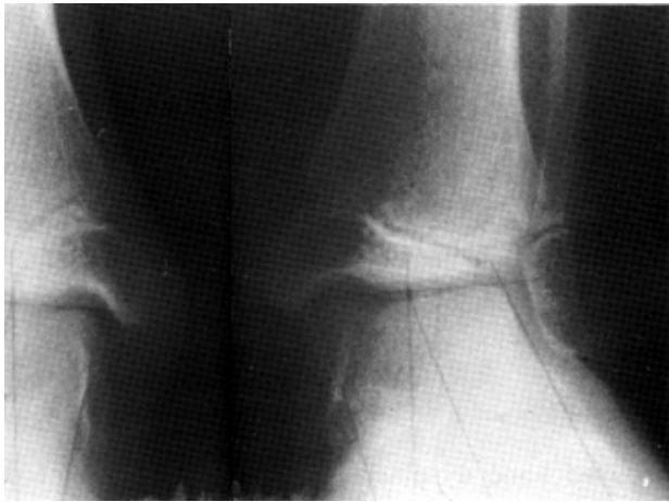
Fig. 1: Case L Boy 11 year-old. Flattened and wedged laterally distal tibial epiphyses with fragmentation of the left one.